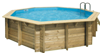
Wood structured pool