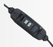
5m power plug with 10 mA differential protection

Multilingual packaging with reinforced structure, including all accessories