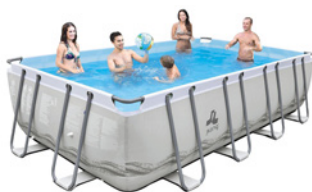
Above ground pools