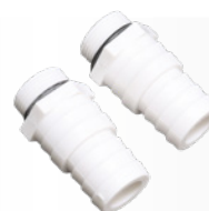
PVC connectors Ø 32-38 mm