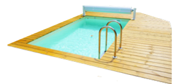
In-ground pool <35m 3